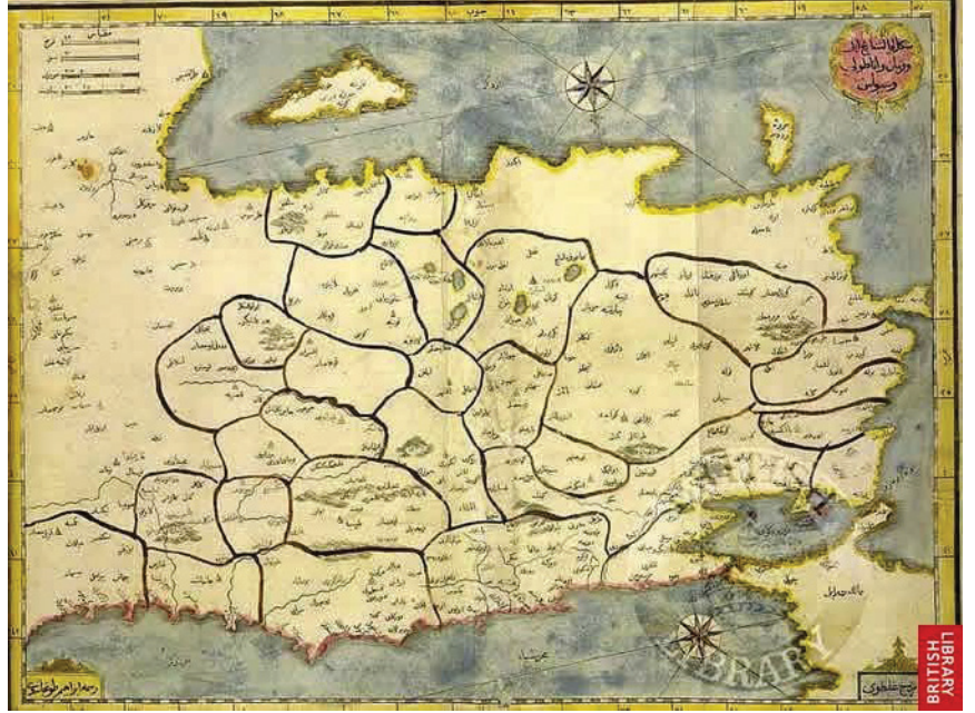
<u>Figure 1:</u> A reversed map of Anatolia from Katib Çelebi's Cihannüma . On the up right corner the note states "the map of İçil, Karaman, Anadolu and Sivas provinces" ( Şekl-i Eyalet-i İçil ve Karaman ve Anadolu ve Sivas ).

lands were made up of eighteen vilayets . After making some generalizations the character of the Kurds he emphasizes that the they were Şafi'i and ehl-i Sünne .<sup>14</sup>