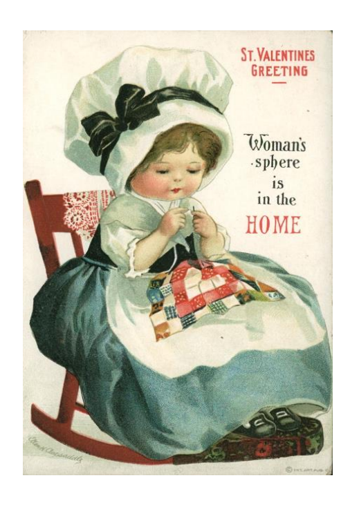
Figure 1 St. Valentine's Greeting—Women's Sphere is in the HOME (1909)<sup>3</sup>

From the feminist perspective, the "New Woman" represents the feminist ideals of the fin-de-siècle , as the opposite of the Victorian "Angel in the House." American author Winnifred Cooley, in The New Womanhood , suggests that "[t]he new woman seeks only to be a free individual" (1940, p. 40). Cooley also elaborates on the paradox of this concept by exemplifying it with types of women from history: